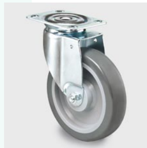
2670 PAP 100 P52