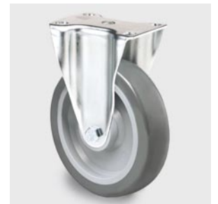
2678 PAP 125 P52