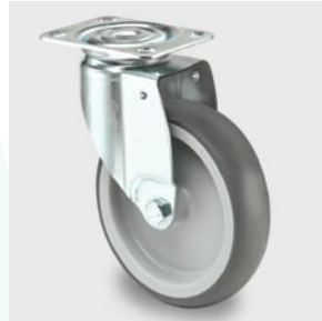
2670 PJO 100 P52