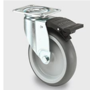
2675 PJO 100 P52