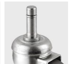
B10 with Grip ring