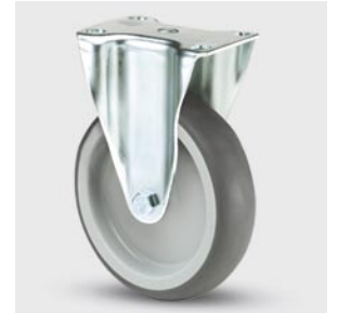
2678 PJO 125 P52