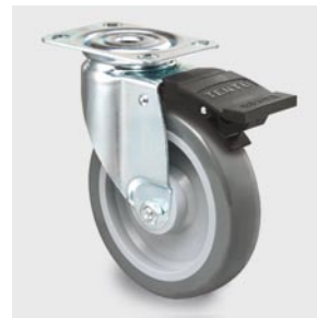
2675 PAP 100 P52