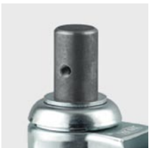
R05 Solid plug round

△ 2671 Swivel Casters with directional lock only with plate P52 or stem R05 available.